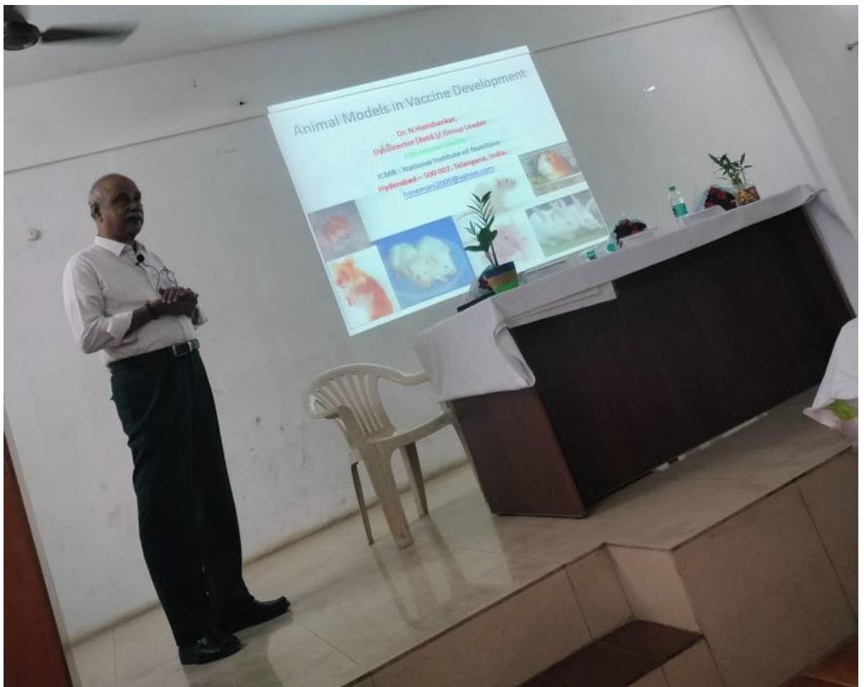
Photographic View of the poster